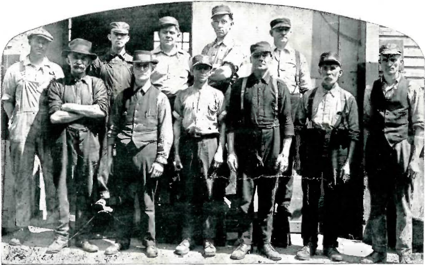
The Blacksmithing and Tool Tempering Forces