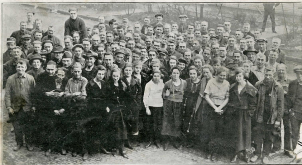
The Foundry Division