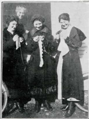
Core room girls enjoying January sunshine and industriously knitting at the same time