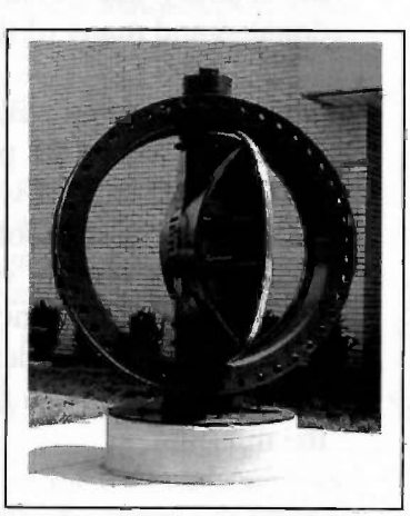
54" Butterfly Valve at front entrance

This issue of the Newsletter is dedicated to the museum itself. Those readers who have seen the new building and exhibits know why we are so proud of our new museum. If you have not had the opportunity to visit, we hope that you will do so soon. The previous issue of the Newsletter featured a cover illustration of the architect's rendering of the building – this issue features a photo of the genuine article as seen from Eldorado Street.