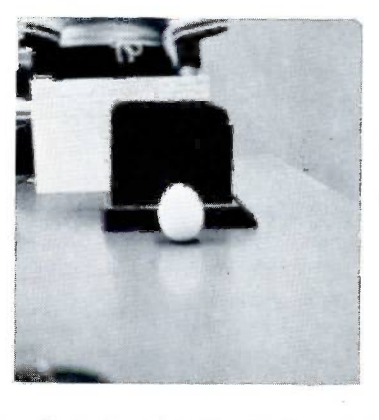
First day of spring is the only day that an egg can be stood on end as shown in this photo.